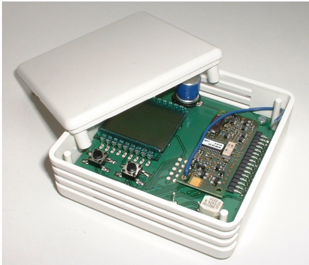
Figure 1: Gateway

ENO 610 acts as a gateway between EnOcean radio sensors and the KNX bus. It has 32 channels, each of which can be configured with one of the following functions: